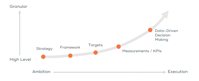
Figure 3. Maturity Journey: Achieve Sustainability Ambitions via Executable Initiatives

Essentially, it's all about gaining an in-depth understanding that leads to smarter, data-driven decision making, while balancing profitable sustainability against all of your other business performance characteristics. There is no point becoming the most sustainable business in the world if the business ceases to be a viable operation as a result of that vision. To succeed, you need to bring in vast new data sets to an already data rich environment. The challenge then becomes how to leverage all of that data by using analytics to deliver the optimum balanced outcome desired.